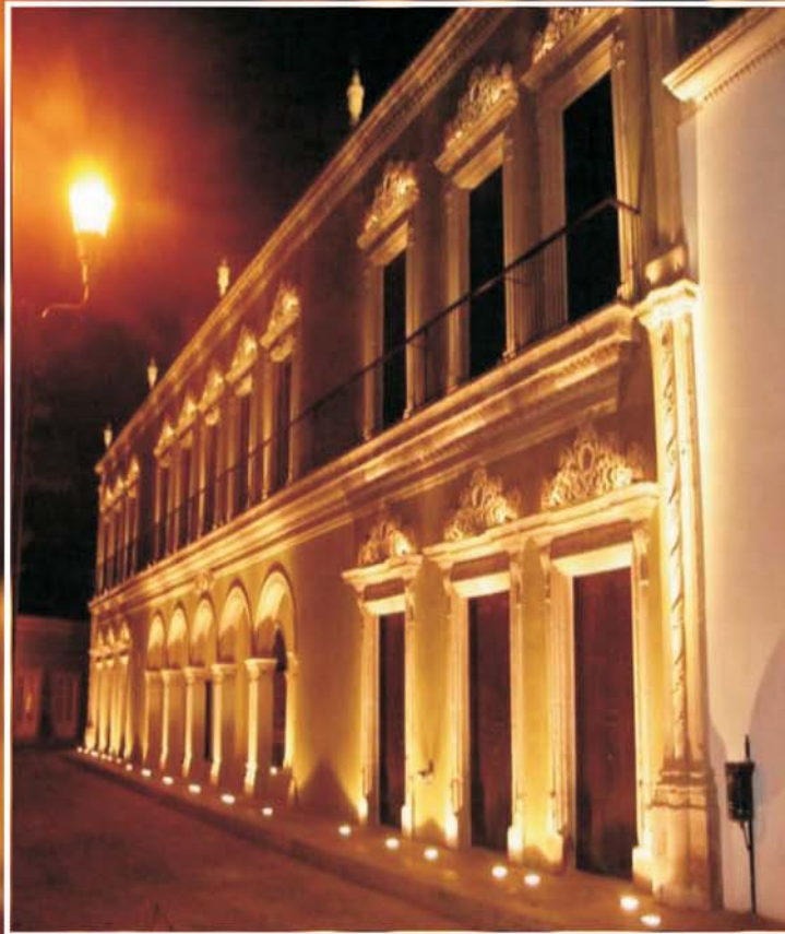
Teatro Hinojosa, Jerez, Zac.